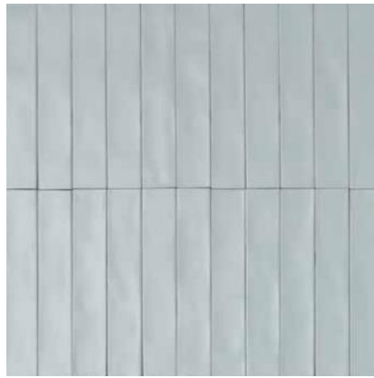
Messina Grey Blue