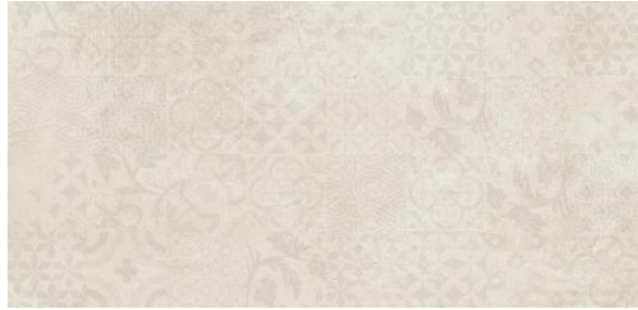
WEAVE DECOR AVAILABLE IN ALL COLOURS