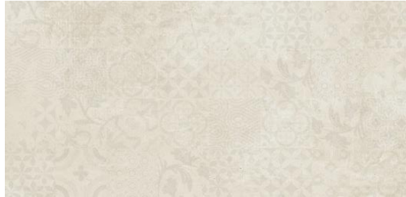
WEAVE DECOR AVAILABLE IN ALL COLOURS